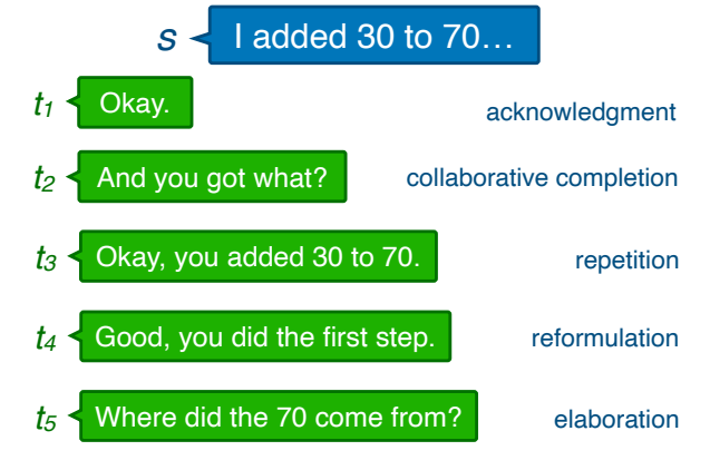
Figure 1: Example student utterance s and possible teacher replies t, illustrating different uptake strategies.

Building on the interlocutor's contribution via, for example, acknowledgment, repetition or elaboration (Figure 1), is known as uptake and is key to a successful conversation. Uptake makes an interlocutor feel heard and fosters a collaborative interaction (Collins, 1982; Clark and Schaefer, 1989),